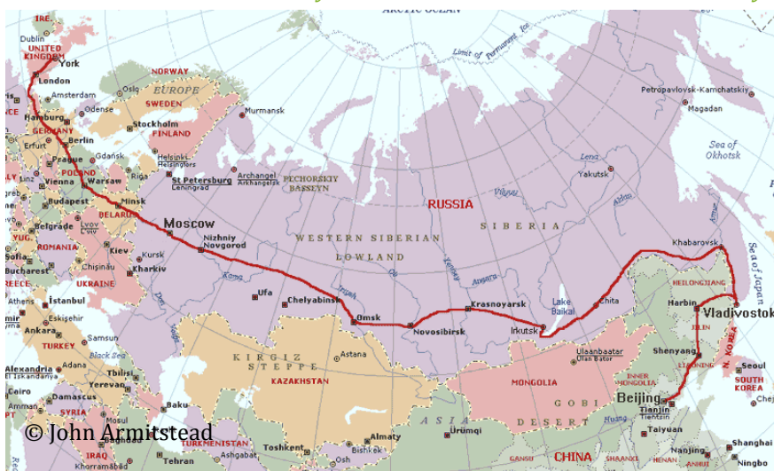
Trans-Siberian Railway Map: Transportation system extending all the way to the United Kingdom

Traveling would also become more convenient for people in