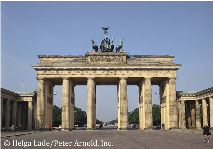
Brandenburg Gate in Berlin, Germany