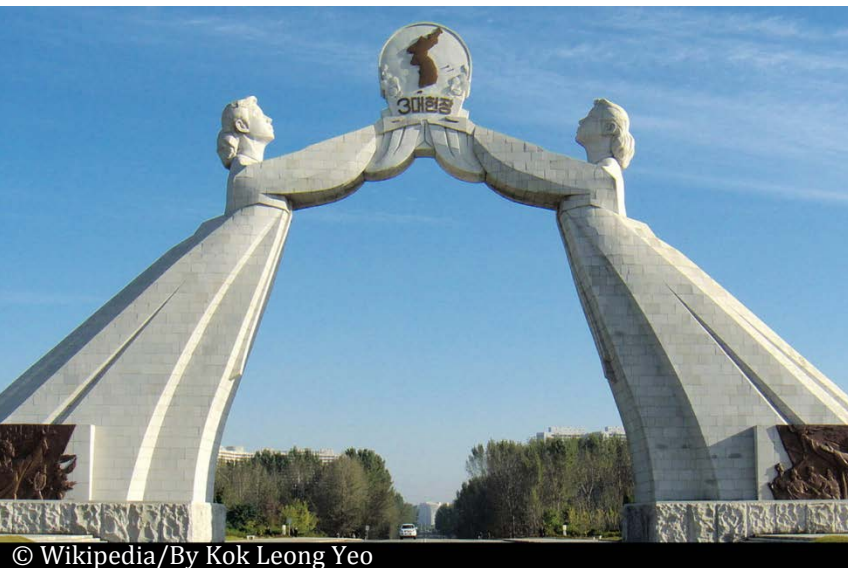
Arch of Reunification in Pyongyang, North Korea